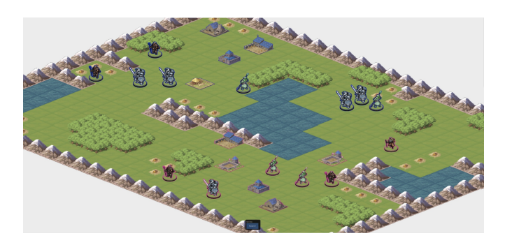
Fig. 1. A classic scene of Stratega framework.