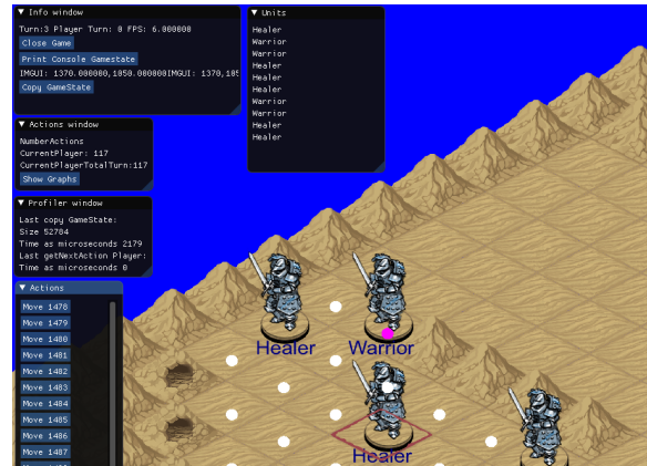
Figure 2: Exemplary game state of STRATEGA and its GUI.

files. The excerpt of the Action YAML-file shown in Figure 3 shows the definition of an Attack action. Several properties can be configured and even new properties can be added to the framework. In the example, the attack action has a range of 6 tiles, damage of 10 (that can affect friendly units) and establishes if and how much score the attacker and attacked players receive when the action is executed.