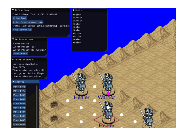
Figure 2: Exemplary game state of STRATEGA and its GUI.

files. The excerpt of the Action YAML-file shown in Figure 3 shows the definition of an Attack action. Several properties can be configured and even new properties can be added to the framework. In the example, the attack action has a range of 6 tiles, damage of 10 (that can affect friendly units) and establishes if and how much score the attacker and attacked players receive when the action is executed.